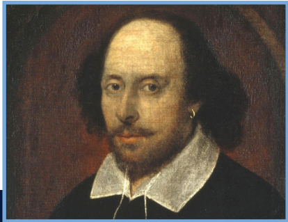
ENGL 421 Shakespeare I