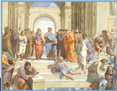
PHIL 451 The Great Philosophers