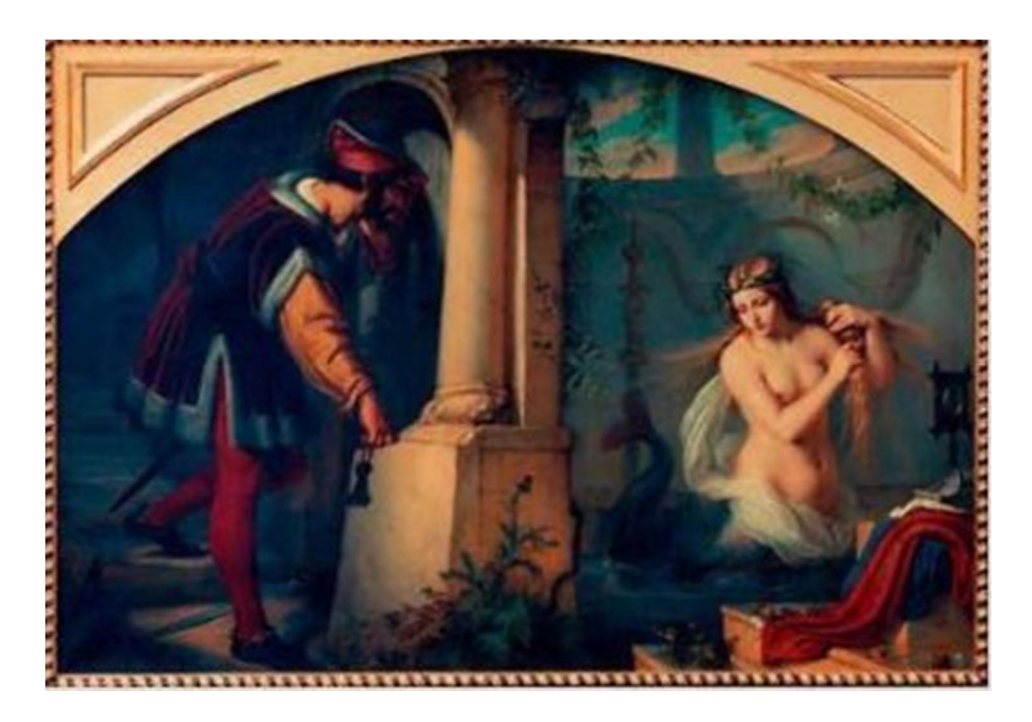
2- The Fair Mélusine by Julius Hübner, finished in 1844, depicting a bathing Mélusine. By this time, Mélusine has become a mermaid and no longer has a serpent s tail but a fishtail.