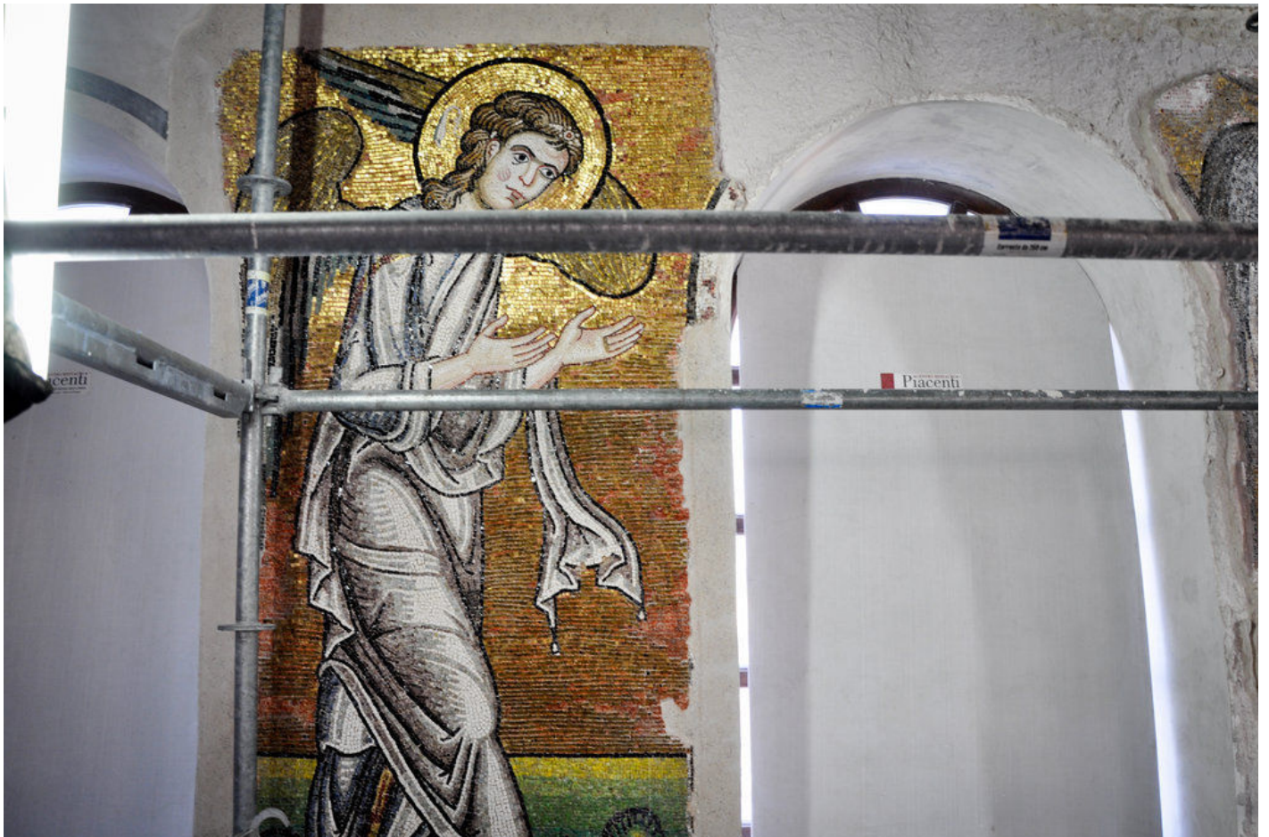
More photos of the art work from the Latin Patriarchate of Jerusalem