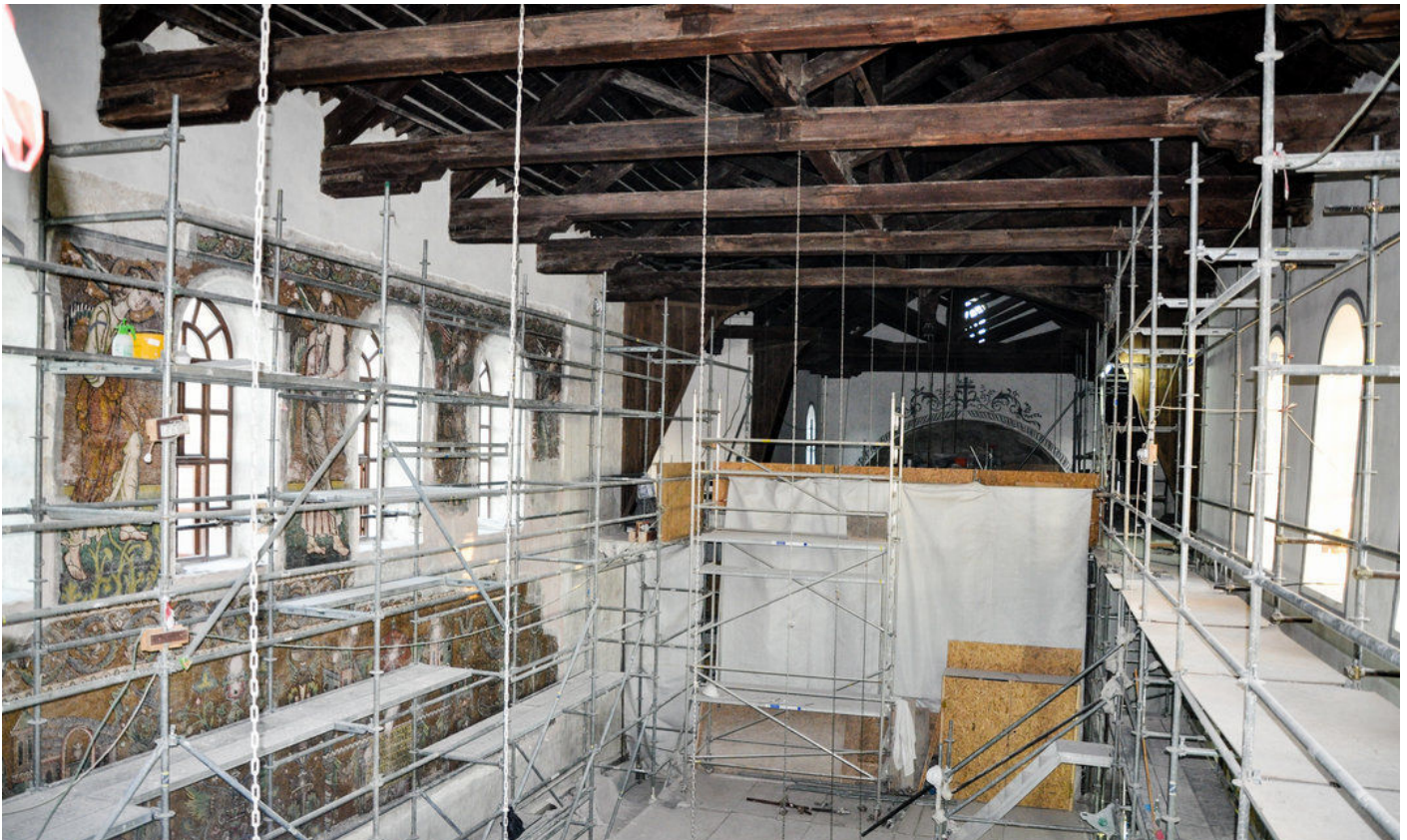
The restoration work taking place at the Basilica of the Nativity in Bethlehem