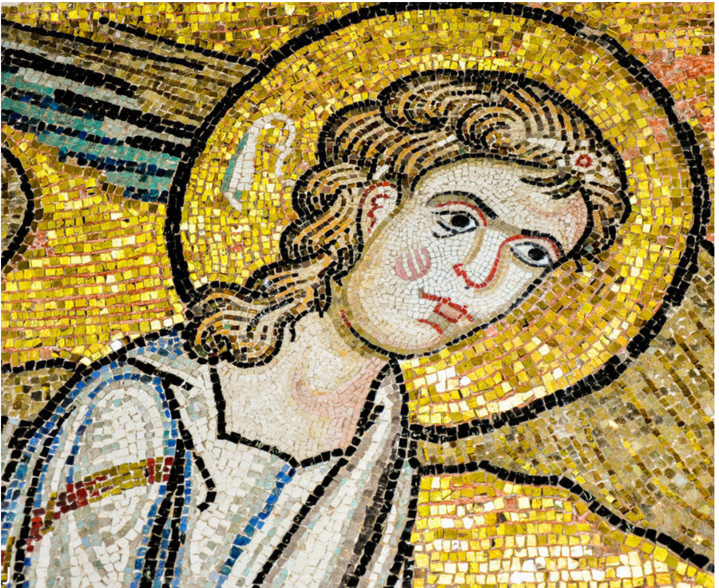
Mosaic from the Basilica of the Nativity - photo courtesy Latin Patriarchate of Jerusalem

By Saher Kawas, Latin Patriarchate of Jerusalem