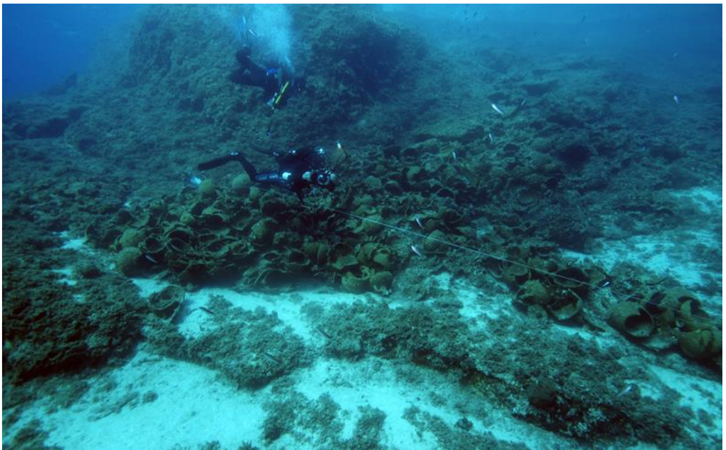
Archaeologists survey the scatter of a Late Roman shipwreck

An archaeological expedition has recorded 22 shipwrecks over 13 days in what may be the ancient shipwreck capital of the world.