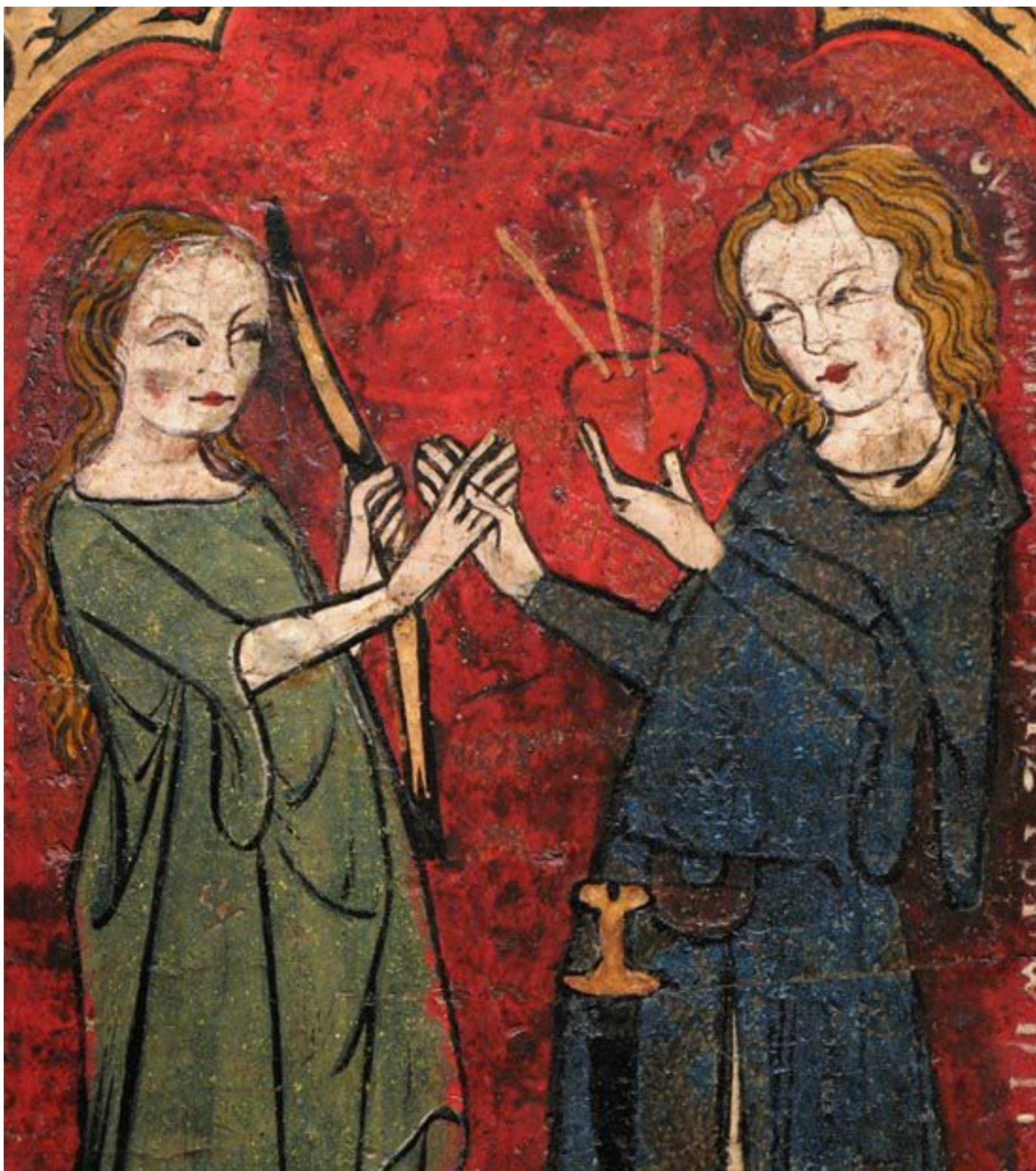
14th century depiction of Frau Minne, the personification of courtly love