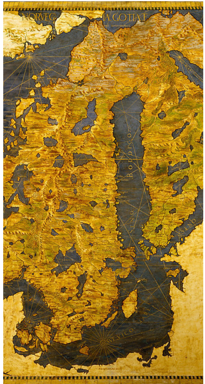
Map of Scandinavia by Egnazio Danti (1536 - 1586)