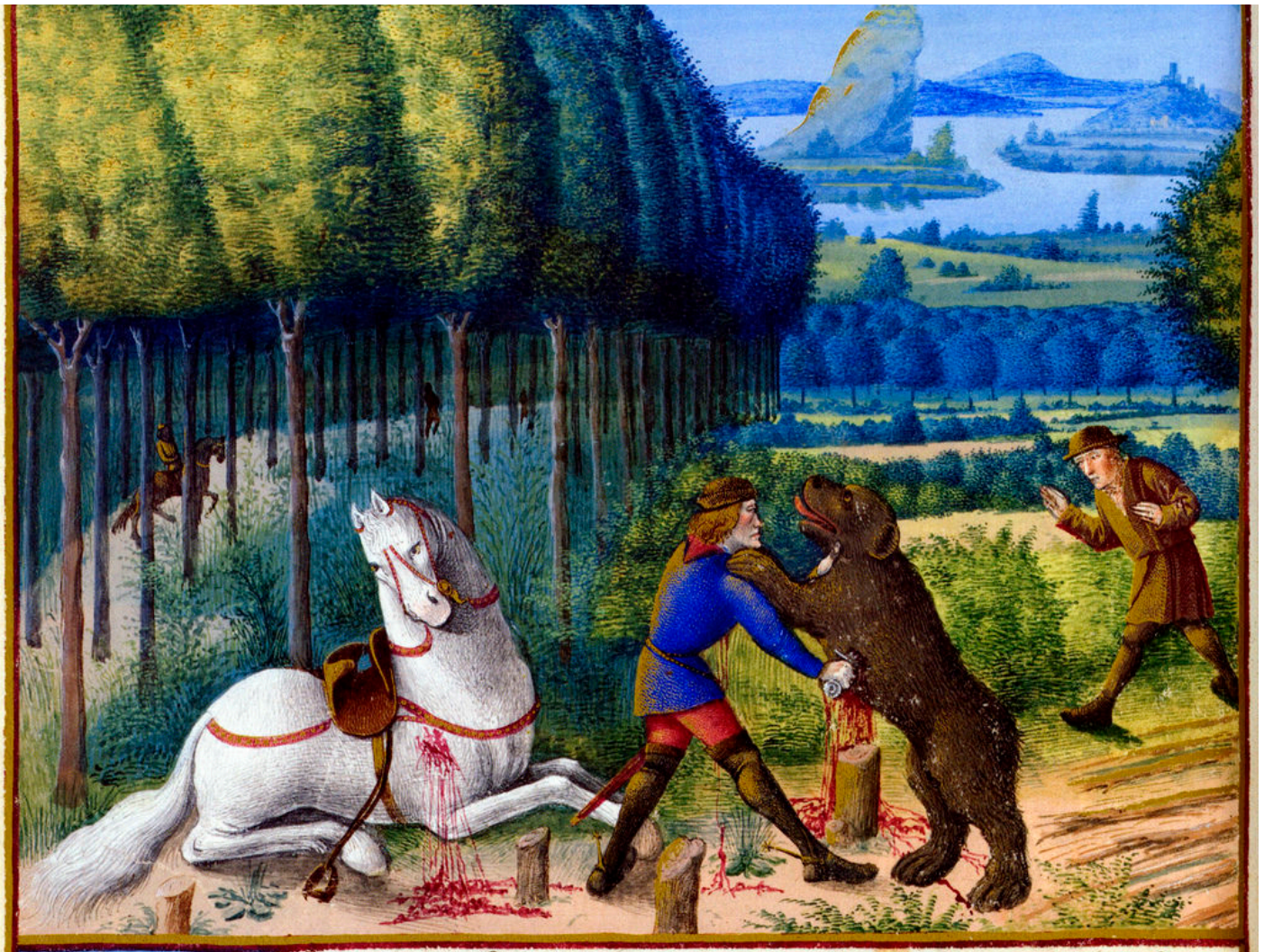
Godfrey of Bouillon slaying a bear, f. 41v. Sébastien Mamerot, Les Passages d'Outremer , Fr. 5594, BnF

district, or at least those who went into the forest, according to their account. The duke, then, as he was accustomed and ready to help his Christian comrades at all times of misfortune, hastily drew his sword, vigorously spurred his horse and swooped down upon the wretched man; he hastened to snatch the distressed pilgrim from the butcher's teeth and claws, and racing through the middle of the thicket with a loud shout he was exposed in the way of the cruel beast. When the bear saw the horse and its rider bearing down on it at a gallop, trusting its own fierceness and the rapacity of its claws, met the duke face to face at no less speed, opened its jaws to tear his throat, raised up its whole body to resist – or rather to attack, unsheathed its sharp claws to rip him to pieces; it drew back its head and forepaws, carefully guarding against a blow from the sword, and, wishing repeatedly to strike, it feinted. Indeed it roused all the forest and mountains with its dreadful roaring, so that all who were able to hear it wondered at it. The duke, reflecting that the cunning and evil animal would oppose him with bold savagery, was keenly provoked and violently angry, and with the point of his sword turned towards it he approached the brute in a rash and blind attack, to pierce its liver. But by an