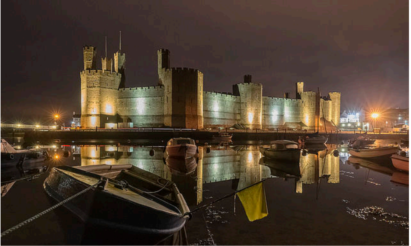
Caernarfon Castle at night

A true citadel, Caernarfon Castle casts a long shadow – its meticulously calculated and formidable stonework heavy with the weight of symbolism. Raised by Edward I (and I wince to do this, Longshanks of Braveheart fame) in 1283. Perhaps more than any other castle found within the British Isles, Caernarfon embodies that most terrifying of a castle's aspects; a tool for the aggressive and utter domination of territory. Rising from a time of war, every beautifully designed facet of the castle is a manifesto for the imperialistic dreams of the English monarchy whose burning ambition laid a new narrative and shape upon the tumultuous relationship between England and its Celtic brothers.