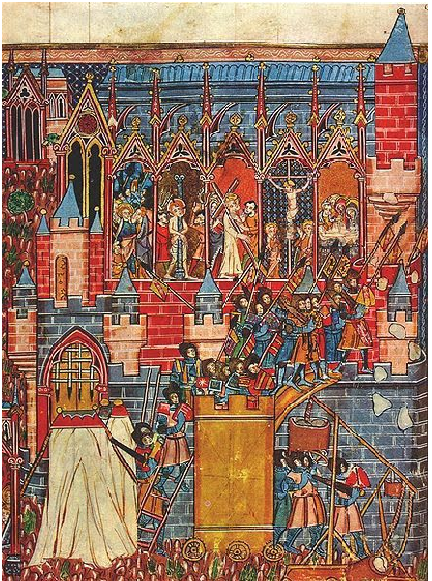
Siege of Jerusalem