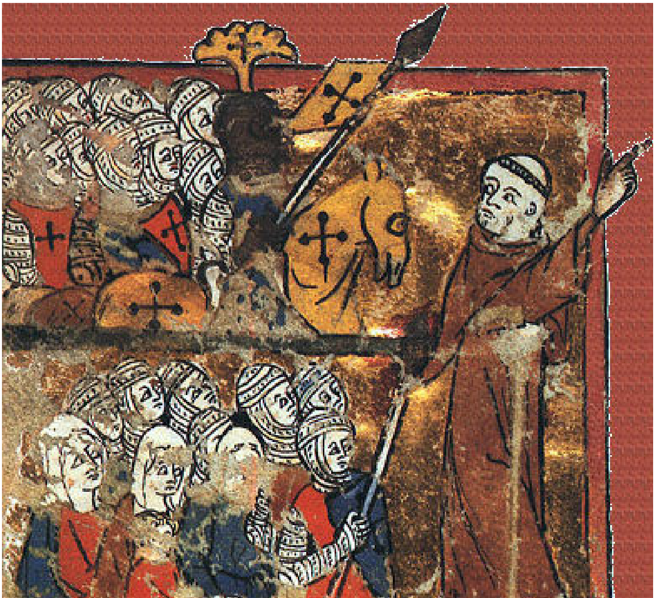
Peter the Hermit leading the People's Crusade

customs?" The insolent count made no reply to Baldwin, but said in his barbarous language, as if talking to himself, "This must be a rude fellow who would alone remain seated when so many brave warriors are standing up." Alexis noted the movement of the man's lips and called an interpreter in order to learn, what he had said; but when the interpreter had told him he did not complain to the Franks, although he did not forget the matter.