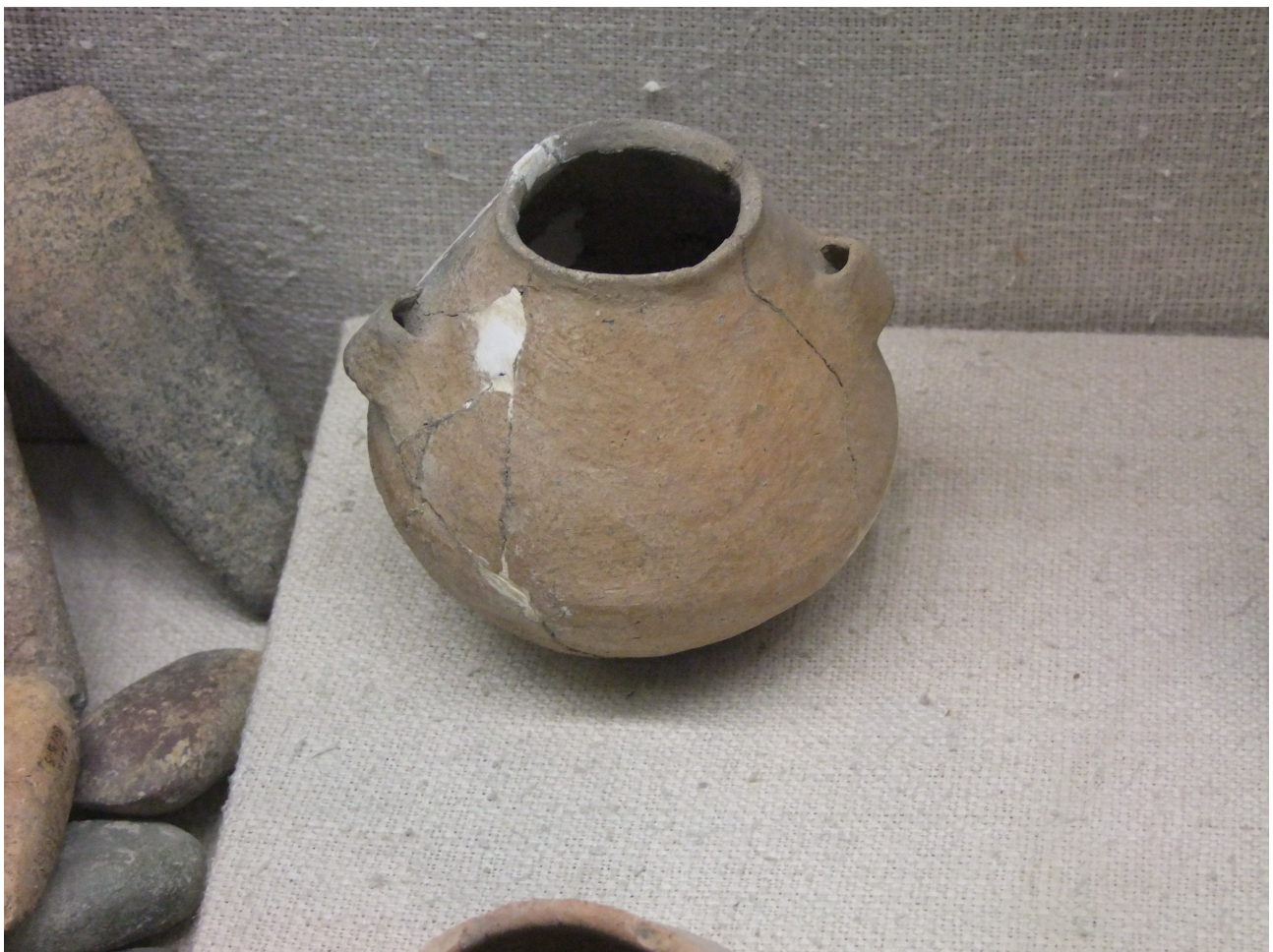
Fire pot dated at c.5800BC and preserved in the Antalya museum which is close to the Adriatic end of the Silk Road.

Fire has been exploited by man since prehistoric times and appears in all known civilisations. The means of making fire varied with different cultures but, until the mid 18th C, it was universally a slow and laborious process. It is no surprise, therefore, that early man, particularly nomadic peoples, developed a simple means of transporting a small source of fire from which he could rapidly kindle a flame when needed 2 . This was the Firepot, a small clay pot holding glowing charcoal. At a time when fortifications were often a wooden stockade and roofs were thatched, it was an obvious ploy to lob firepots at your enemies defences 3 . It would have been suspended from leather thongs in normal use to avoid setting fire to adjacent materials and these provided a very effective means of throwing in the manner of a slingshot. An impromptu experiment indicates that a range of 30 yards or more was easily attainable at a first attempt with surprising accuracy.