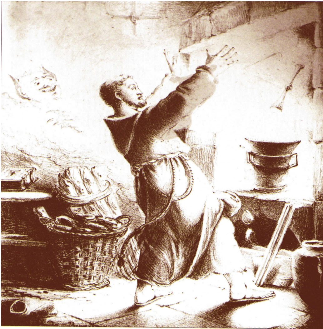
Berthold Schwarz discovers gunpowder

There is a Chinese tradition that a cook carrying a bowl of saltpetre slipped and dropped it onto a charcoal fire. That would certainly create a considerable conflagration but, as the ingredients were not mixed, hardly an explosion. We should also question what the cook was doing with the saltpetre. At that time it was an expensive commodity largely used in the extraction of metals but not common in Chinese cooking. Again, the presence of sulphur is not explained.