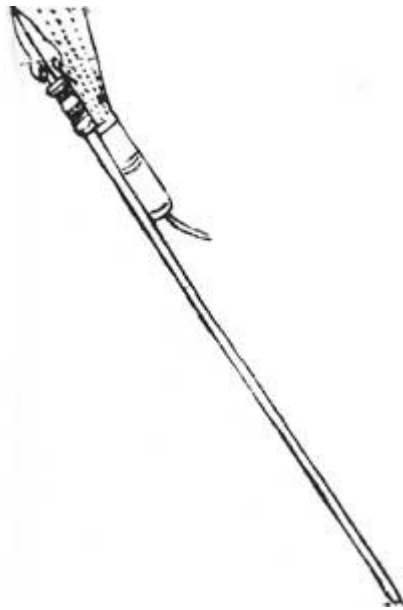
Ho Qiang from a 10th century A.D. Painted Silk Banner

If we make the, not unreasonable, assumption that with bamboo, commonly used for containers might be used as a disposable fire pot, it becomes apparent that, not only is the enhanced mixture not extinguished by being cut off from air, but it can eject flame for a considerable distance. This flaming tube can be pointed or thrown at the enemy or be tied to a spear and used for defence or attack. The Fire Lance is born, the Huo Qiang iv