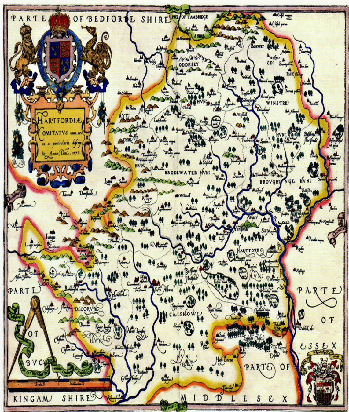
Christopher Saxton's County Map of 1577